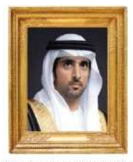
H.H. Sheikh Hamdan bin Mohammed bin Rashid Al Maktoum, Crown Prince of Dubai