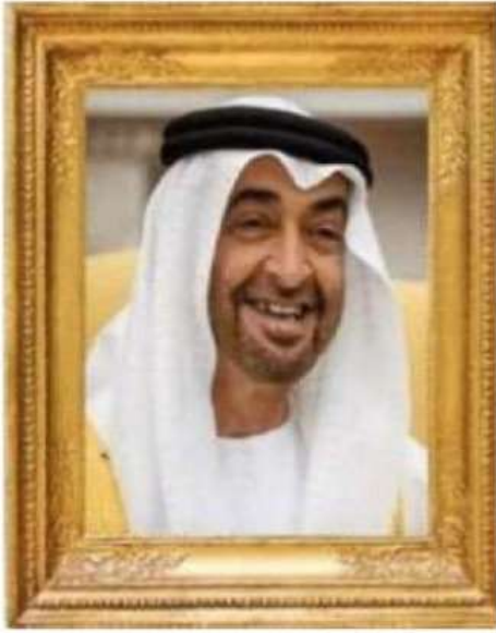
H.H. Sheikh Mohammed bin Zayed Al Nahyan, President of the U.A.E and Ruler of Abu Dhabi