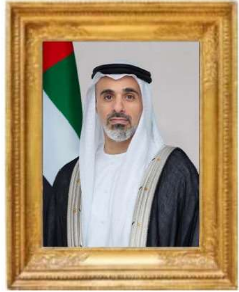
H.H. Sheikh Khalid Bin Mohamed Al Zayed Crown Prince of Abu Dhabi