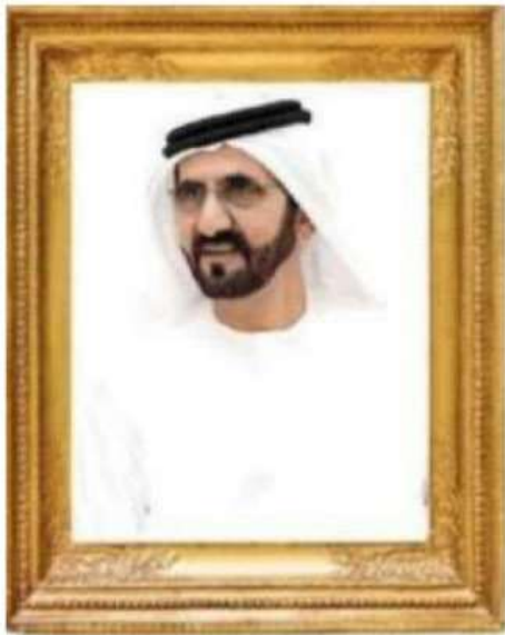
H. H. Sheikh Mohammed bin Rashid Al Maktoum, Vice-President and Prime Minister of the UAE, and the Ruler of Dubai