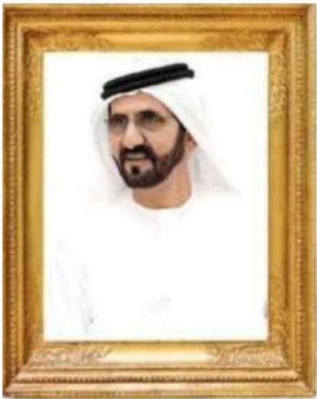
H. H. Sheikh Mohammed bin Rashid Al Maktoum, Vice-President and Prime Minister of the UAE, and the Ruler of Dubai