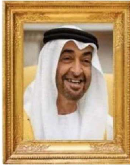
H.H. Sheikh Mohammed bin Zayed Al Nahyan, President of the U.A.E and Ruler of Abu Dhabi