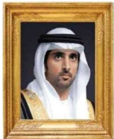
H.H. Sheikh Hamdan bin Mohammed bin Rashid Al Maktoum, Crown Prince of Dubai