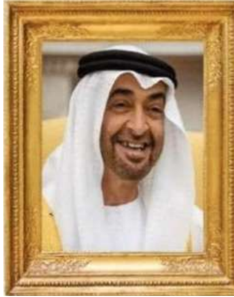
H.H. Sheikh Mohammed bin Zayed Al Nahyan, President of the U.A.E and Ruler of Abu Dhabi