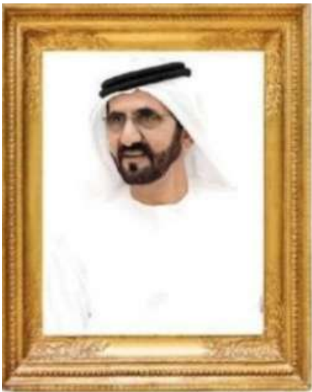
H. H. Sheikh Mohammed bin Rashid Al Maktoum, Vice-President and Prime Minister of the UAE, and the Ruler of Dubai