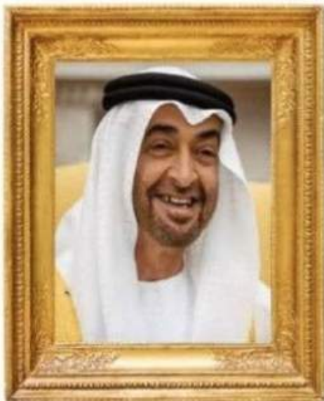
HH Sheikh Mohamed Bin Zayed Al Nahyan, Crown Prince of the Emirate of Abu Dhabi, Deputy Supreme Commander of the United Arab Emirates Armed Forces