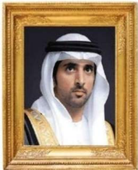
HH Hamdan Bin Mohammed Bin Rashid Al Maktoum, Crown prince of Dubai