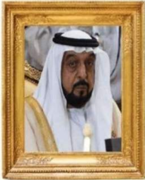
HH Sheikh Khalifa Bin Zayed Al Nahyan, President of the UAE