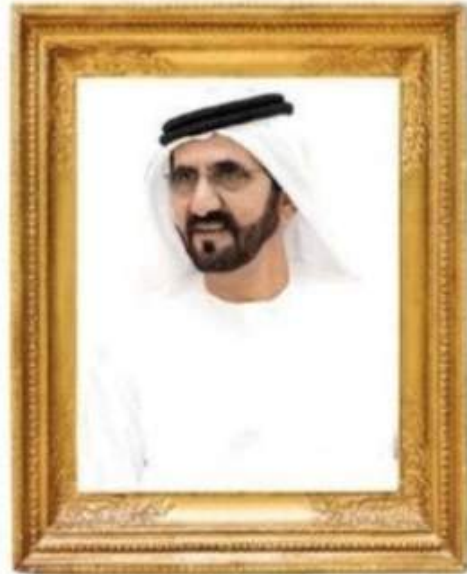
HH Sheikh Mohammad Bin Rashid al Maktoum, Ruler of Dubai, Prime Minister and Vice President of the UAE